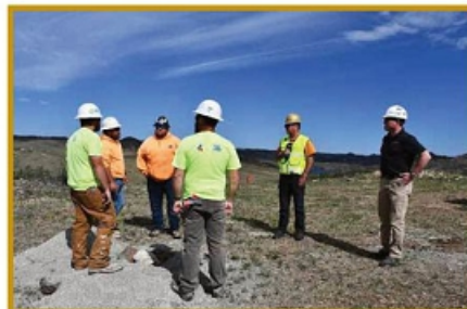
Workers gather during a test blast to monitor ground vibration as part of our comprehensive efforts to assess and mitigate all potential impacts that could be perceived by those near to the CK Gold Project.

- Future outlook for the CK Gold Project: We believe that we can safely mine the CK Gold Project over a number of years with minimal impact and leave a lasting positive legacy that will endure for the long-term. We will continue to work with the Office of State Lands and Investments and the city of Cheyenne (lots of local support, job creation, and economic benefits) to ensure our mining becomes a win-win for everyone it touches, ranging from shareholders to local residents.